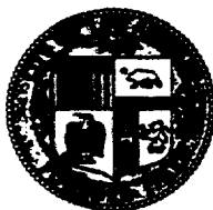
TOM BRADLEY MAYOR